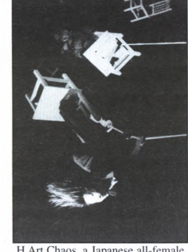
H Art Chaos, a Japanese all-female dance company, will perform across Canada this year

The CYAP cultural website can be located at: www.cyap.com or (in french): www.acap97.com