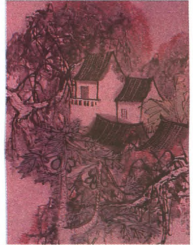
Masterpieces of 20th Century Chinese Painting: an exhibition coming to Canada this year

Tel.: (604) 775-7265 Toll Free: 1-800-952-3493 e-mail: apecinfo@globe.apfnet.org