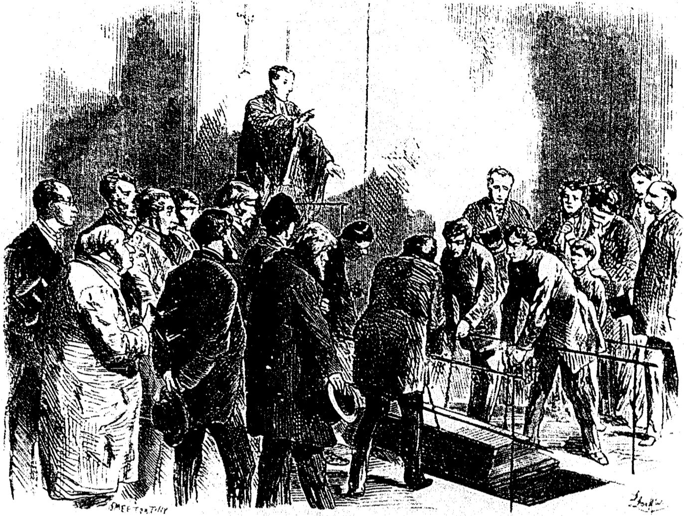
THE CREMATION OF THE DEAD.—LOWERING OF THE BODY OF LADY DILKE INTO THE FURNACE.—FUNERAL CEREMONY.