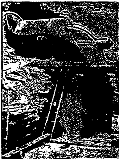
Sherbrooke Street Railway Power Plant— 45 inch Crocker Wheel in Horizontal Setting.

Chicago Store: F. E. DONOHUE, Agent, 241 Madison Street.