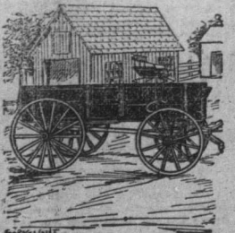
THE NOVA SCOTIA CARRIAGE CO. LTD.