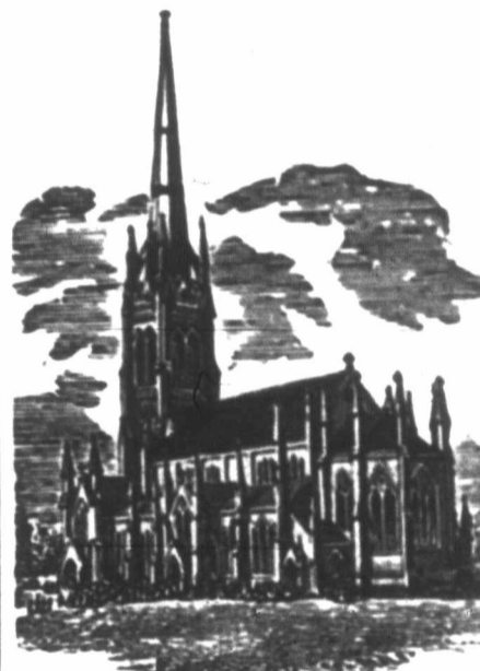
St. James' Cathedral, King St., Toronto, contains 500,000 cubic feet of space and is successfully heated with four of our Economy Heaters.