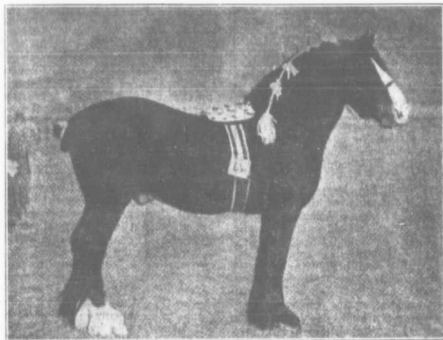
Baron Kitchener (10499).

Clydesdale stallion: failed in 1867. Sire Baron's Pride. Winner of the Cawdor Challenge Cup, at Glasgow, 1867.