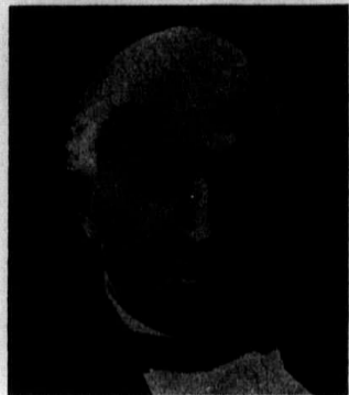
Archbishop of Canterbury

"I want to bear my witness to the supreme importance of the Student Christian Movement in the life of the world to-day."