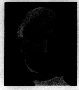
Archbishop of Canterbury