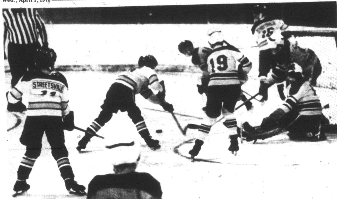
The Streetsville Tyke Tournament was a big success as evidenced in the picture above. The action was great. The teams came ready to play good exciting hockey. Full credit should also go to the organizers of the tournament who did a "super-efficient" job. The championship round is scheduled for this Sunday afternoon, and should be a must on everyone's calendar.