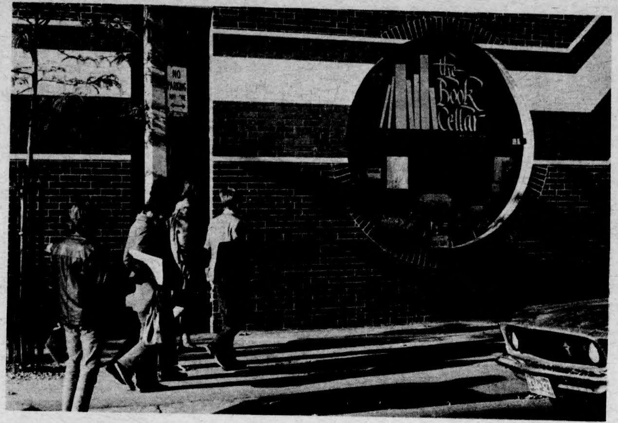
Book Cellar has huge selection of paperbacks, plus hard-to-find magazines, obscure journals.

Volume One — at 6331/2 Spadina Ave. This new shop packs a great deal into one small room. There is quite a mixture here and the prices are very low, I got Howl for 40¢ and Soul On Ice for $1.