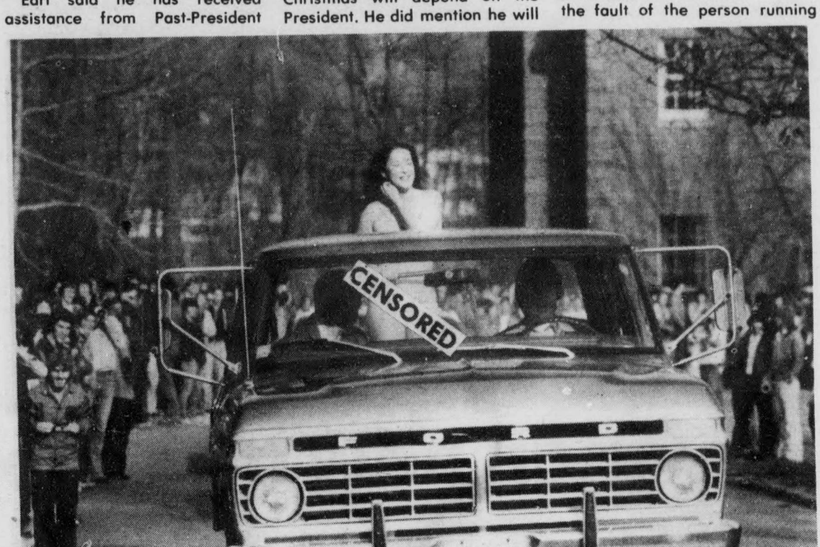
Lady Godiva appeared last week for engineering week.