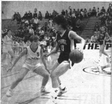
The Pandas demolished the T-Birds 74-45.

Now is a good time to make predictions for next year. Of course, you have to get rid of all the teams which aren't even going to be close. This can be done in a hurry. Atlanta, Detroit, Tampa Bay are the teams which will have terrible years in the NFC (so what else is new?), Cincinnati is the most likely to have a terrible year in the AFC. But don't count out the Jets, Chargers, or the Raiders (Bo Jackson or not, if they don't get a quarterback,