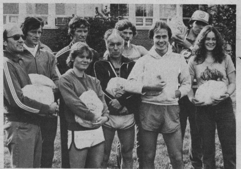
Make room on the mantle for my turkey.

A final note from the Women that their big event, Volleyball began Tuesday evening with eight competitive and forty-two recreational teams to play Tuesdays and Thursdays from 7 - 10 p.m., October 2 - October 11.