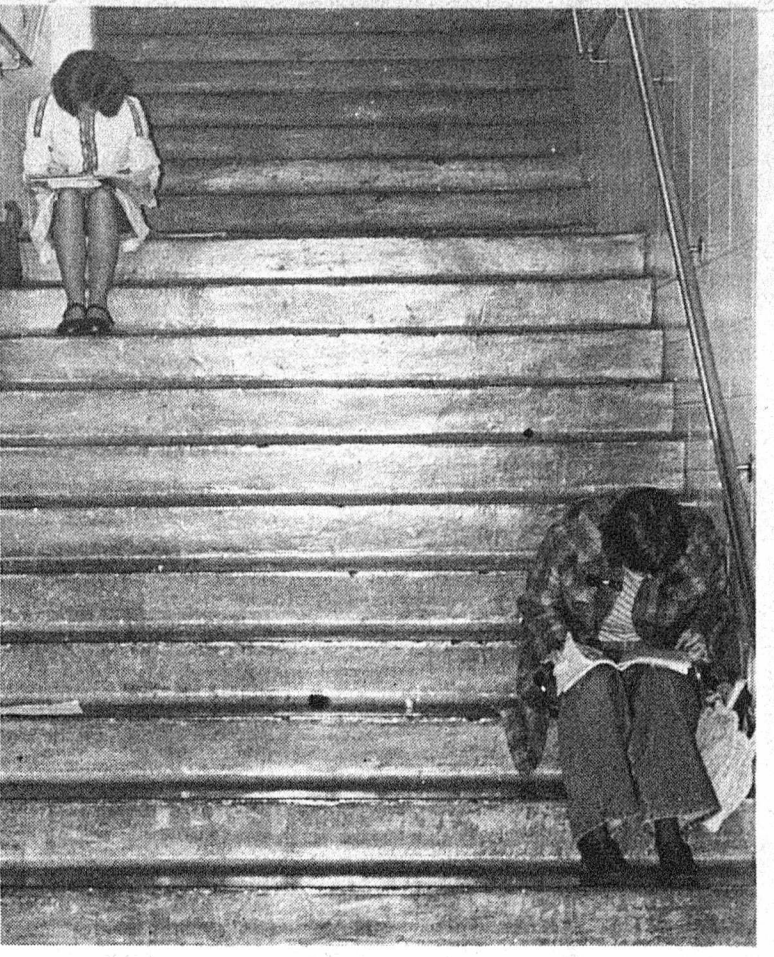
One step at a time. Registration hassles frazzle nerves this week, but it's just a question of moving from part one onwards and upwards to part - beer in Ratt after it's over.

For further information, please call the Continuing Education Division of Grant MacEwan Community College at 462-2680.