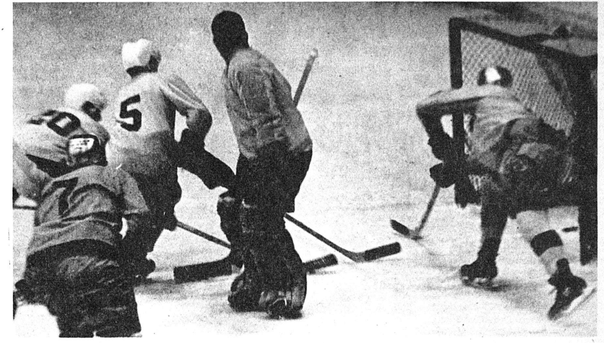
"WHAT ARE YOU DOING BACK THERE?" Earl Gray fires first Bear goal in 4-3 win over Manitoba Bisons, Friday. Gray celebrated return to Bears with two markers.