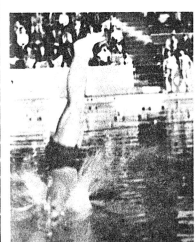
And a half and in.