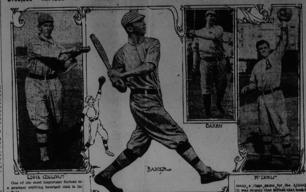
One of the most important factors to a pennant aspring baseball club is its infield.

Take the Athletics' infield. "Stuffy" McInnis, on first; "Reddie" Collins, on second; "Jack" Barry, short stop, and "Bennie" Baker, third base—known as the