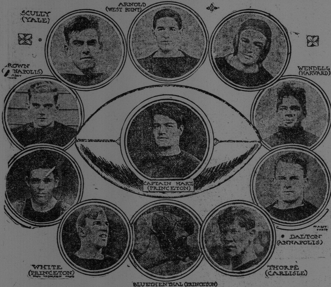
Picking an all-star football team of the East this year is admittedly quite a difficult proposition. The above from warriors represent the selection of an expert after a careful consideration of the candidates for highest honors in the pigskin game.