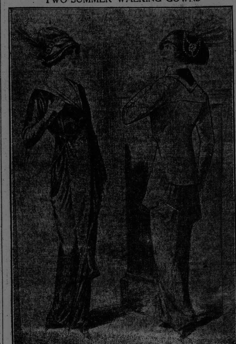
One on left—Gown of Venetian red poplin; draped skirt, with a deep pointed tablier of tinted shadow lace, and weighted with a tassel. One on right—Gown of fine white cloth, with collar of black satin, and cord buttons.