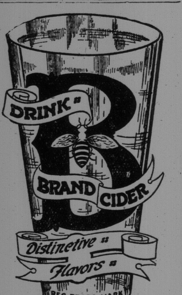
Sold Every where