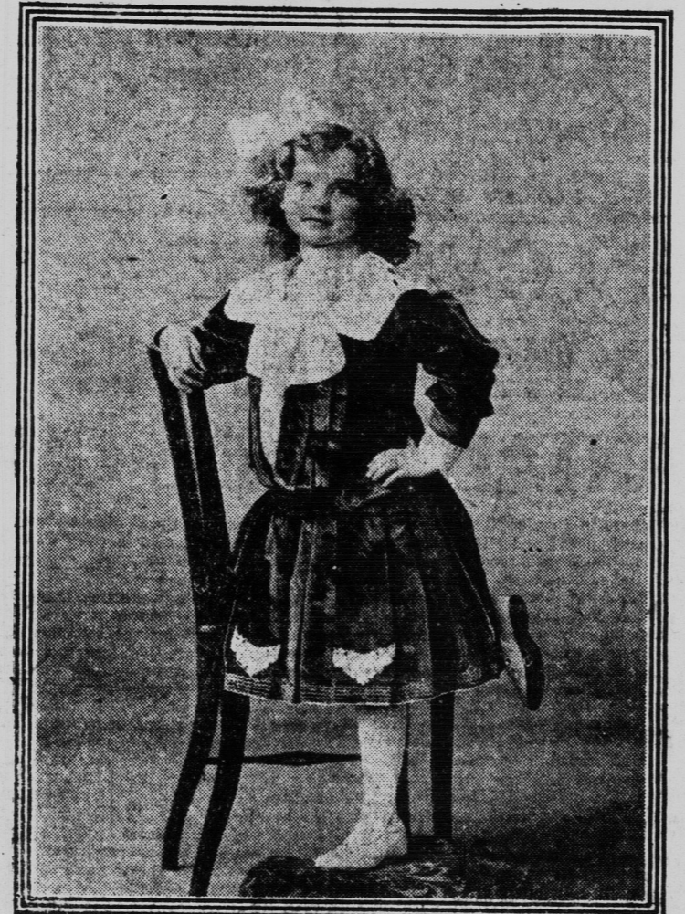
"AND SOME IN A VELVET GOWN." This frock is of black Lyons velvet, with vest and collar and revers of pale blue moire overlaid with rich crocheted touches of embroidery in black and blue. The skirt portion is laid in alternating box and side pleats, the long waist pleated back and front, showing a full view of silk. There was a broad sailor collar and small revers, also of the silk, with trimmings of Irish crochet. Motifs of the Irish crochet are disposed on the bottom of each box pleat, and several rows of stitching finish the bottom.