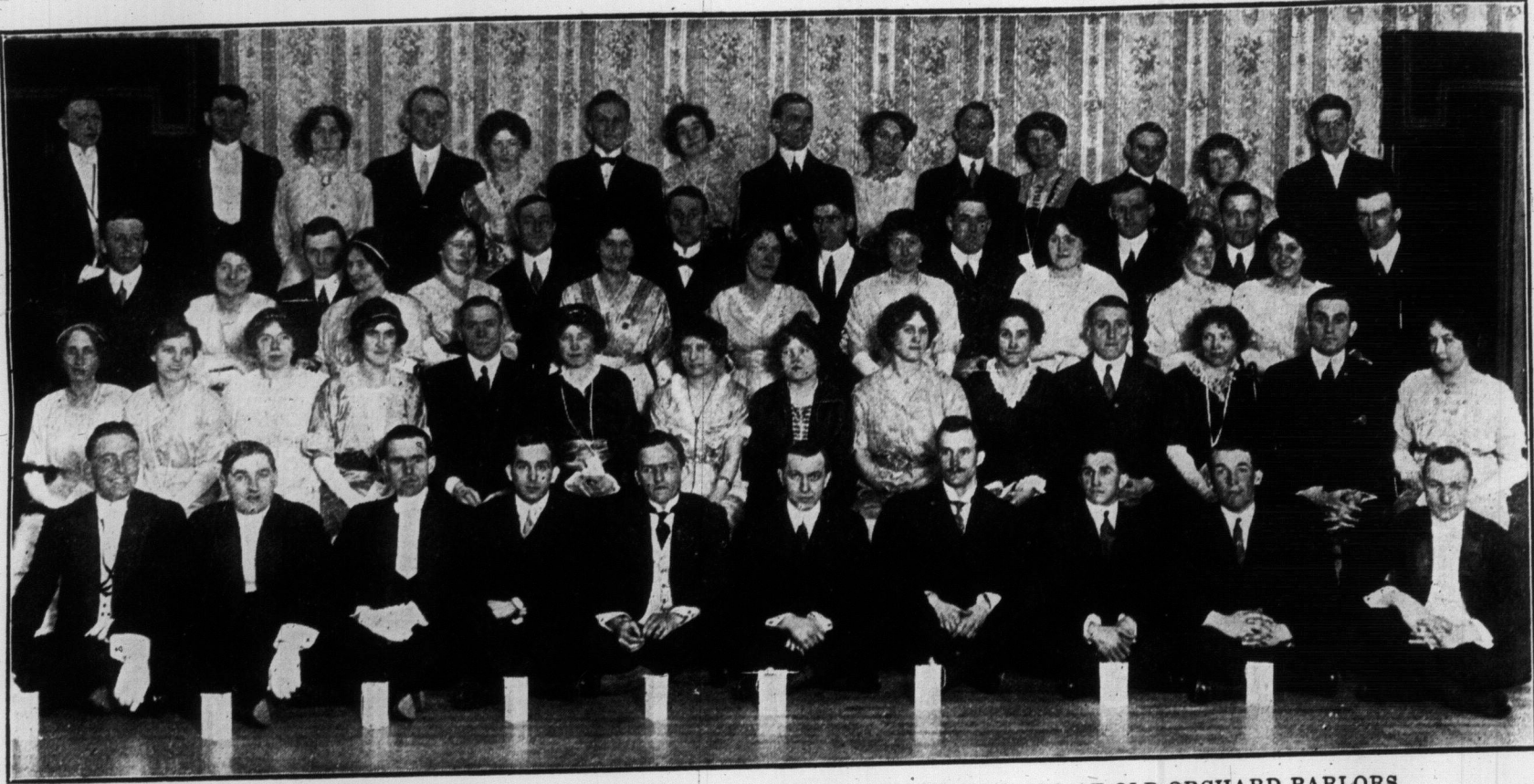
THE RECENT DANCE OF THE UNOMEE CLUB, HELD A FEW DAYS AGO AT OLD ORCHARD PARLORS.