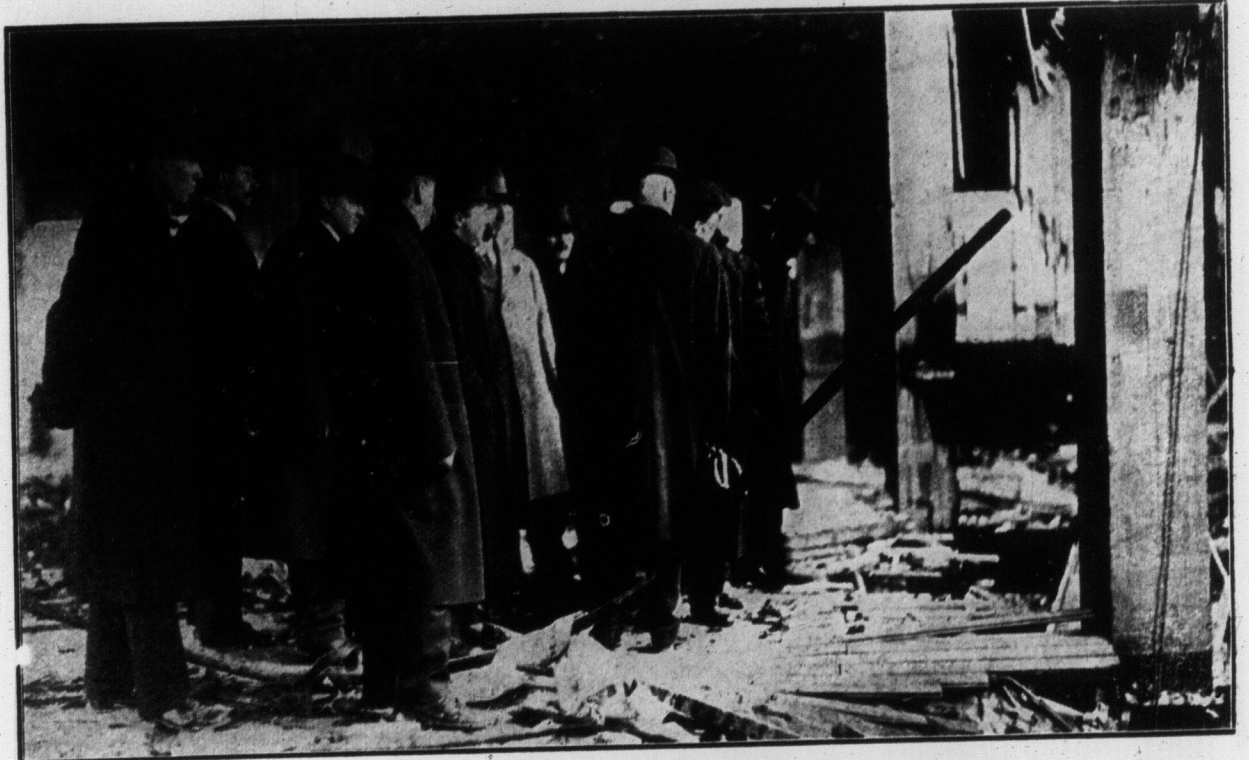
THE JURY INSPECTS THE RUINS OF THE INDEPENDENT CLOAK CO. BUILDING ON WEST RICHMOND STREET, WHERE FALLING WALLS KILLED THREE WRECKERS.