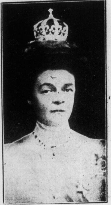
If nothing happens to upset her plans between now and May 21st, Queen Eleanor of Bulgaria, will visit Canada and the States.