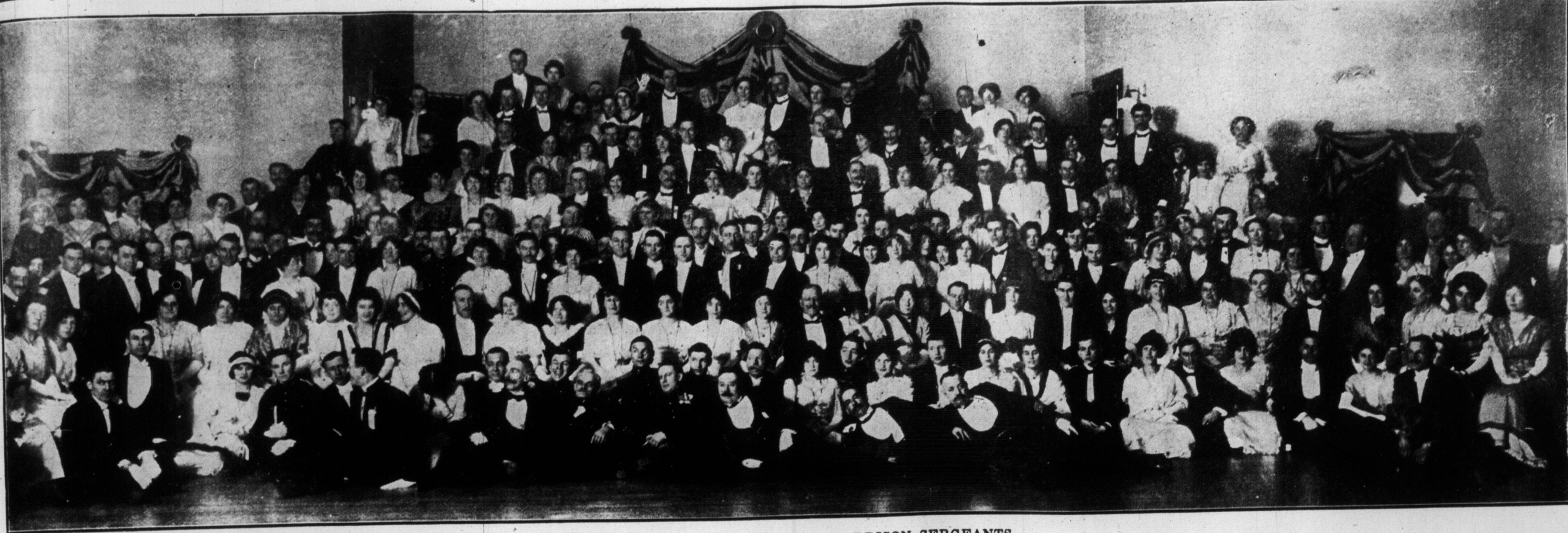
THE AT-HOME OF THE TORONTO GARRISON SERGEANTS