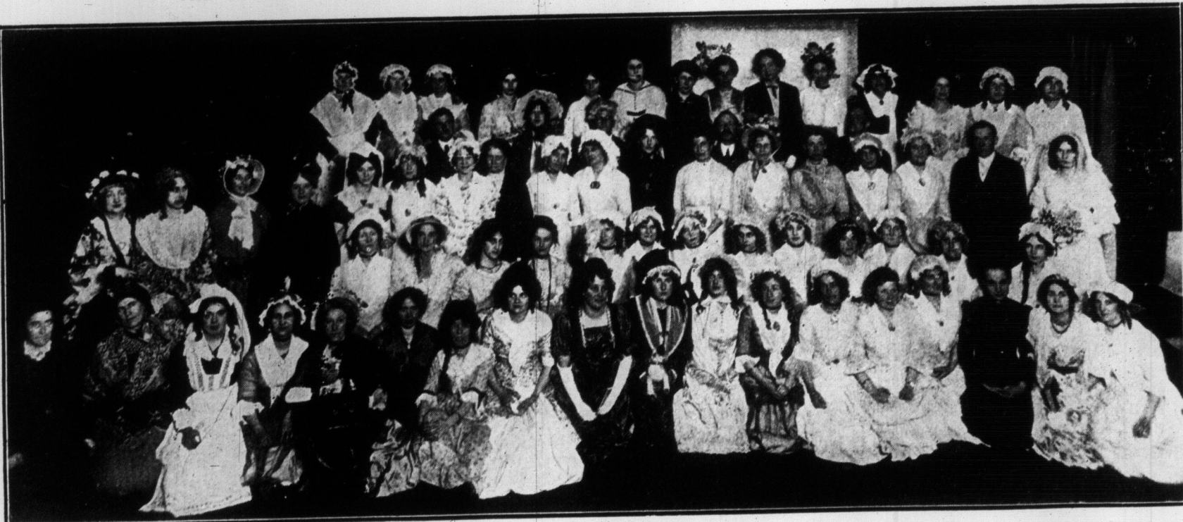
LADIES OF WESLEY METHODIST CHURCH, ARTHUR AND DUNDAS STREETS, WHO PARTICIPATED IN A VERY SUCCESSFUL "OLD-TIME" CONCERT.