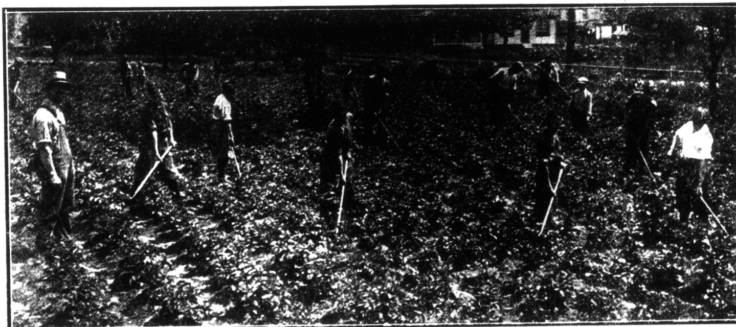
The older boys are given a useful training on the land by a competent instructor.