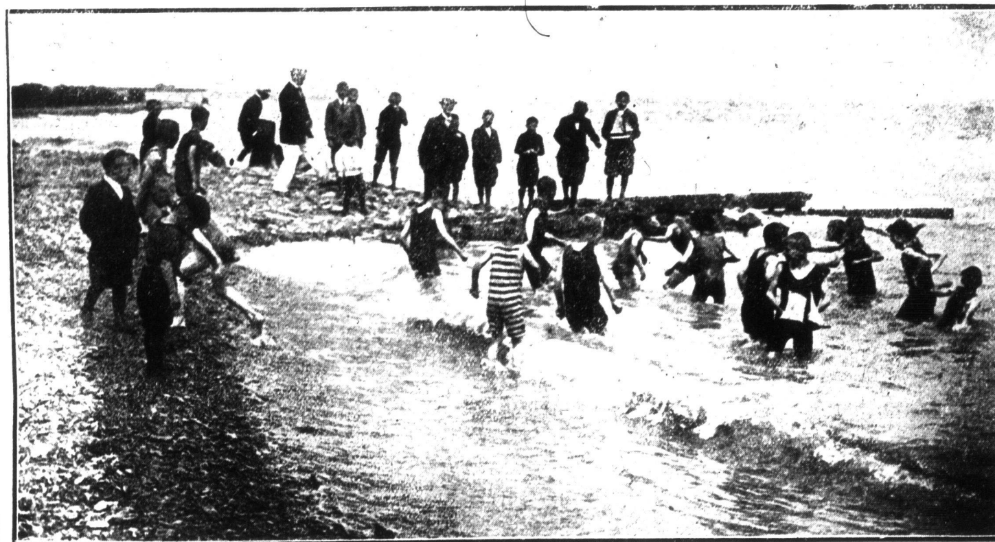
Happy shouts and much noise of plunging and splashing fill the air as child after child join their comrades in cool waters.