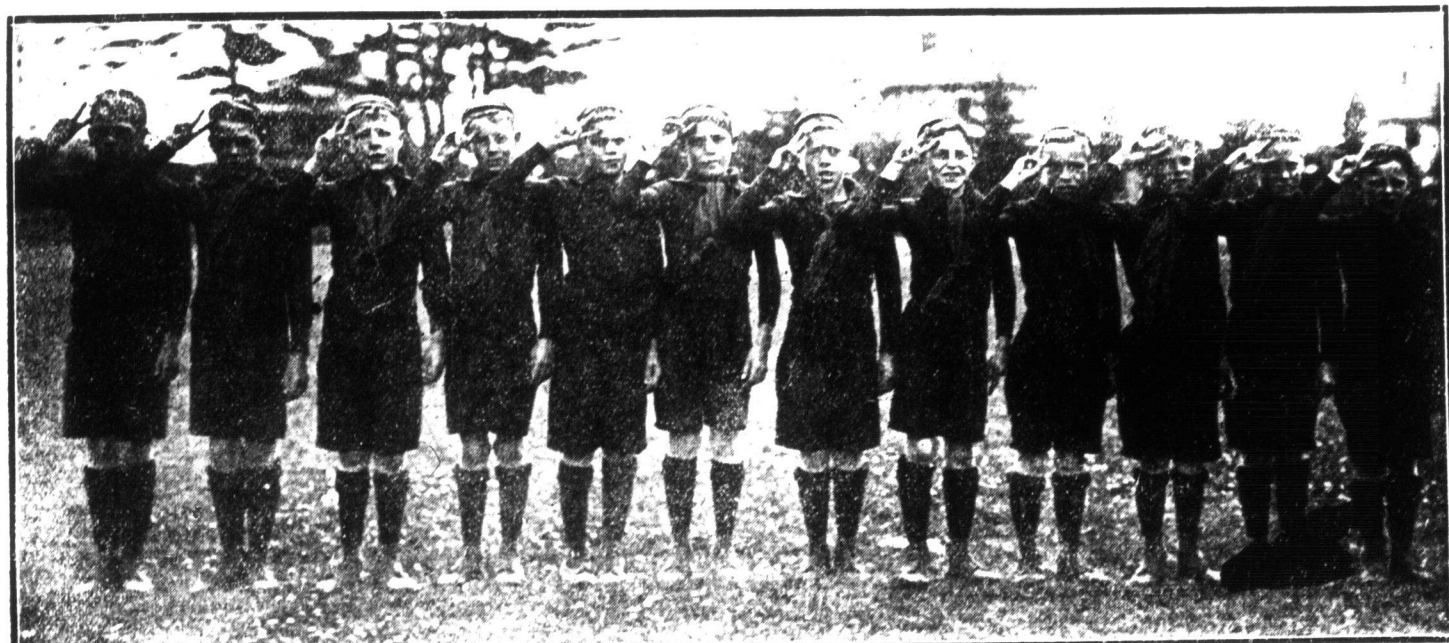
The Boy Scouts, Wolf Cubs' Patrol, come to the salute as the photographer takes their picture.