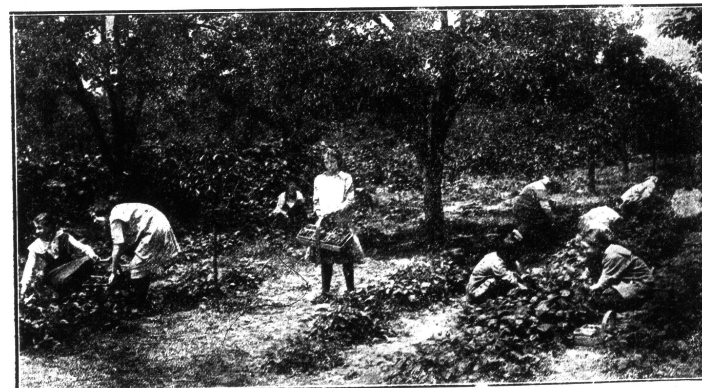
Berry-picking is essentially the girls' occupation, and the results of their labors are preserved and find much favor on the dining-hall table.