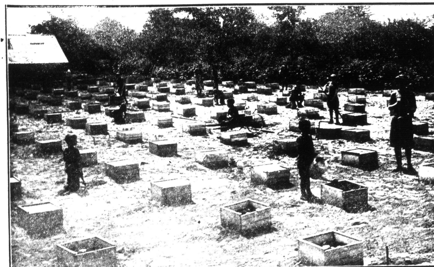
The melon patch is carefully guarded by the "Hustlers' Gang" from all pests, human and otherwise.