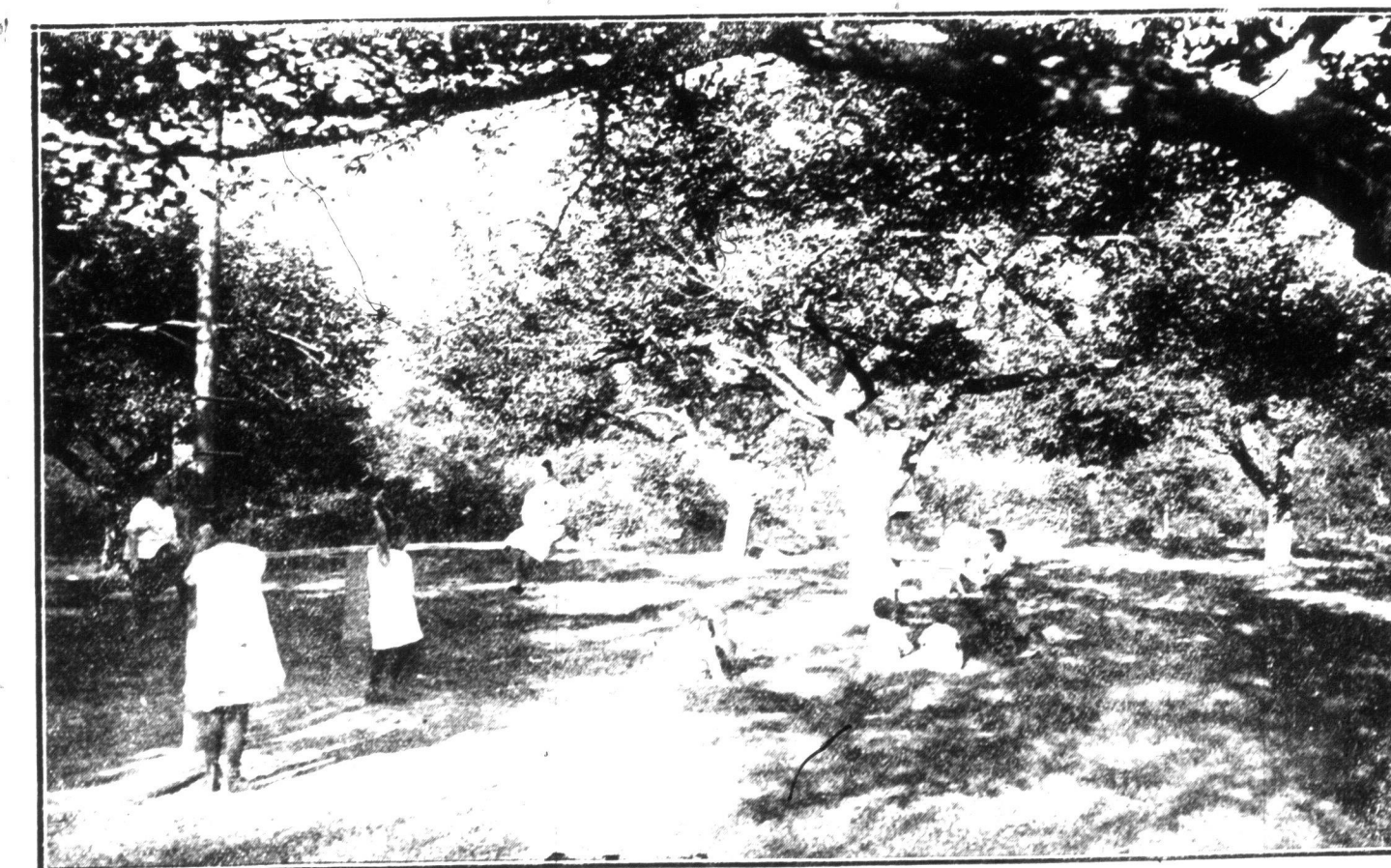
The immense orchard of the Orphanage is a happy hunting ground for the children.