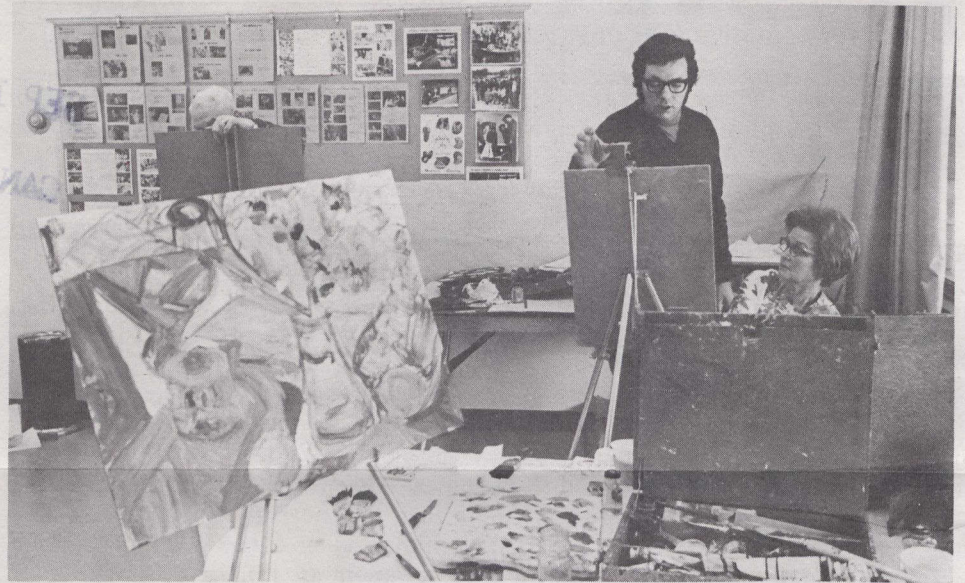
Formal instruction captured the interest of 23 per cent of the population surveyed.

An estimated 3 million, or 20 per cent of respondents, attended at least one popular music concert in the year and, of these, 6 per cent or .9 million, attended one such event in the two reference