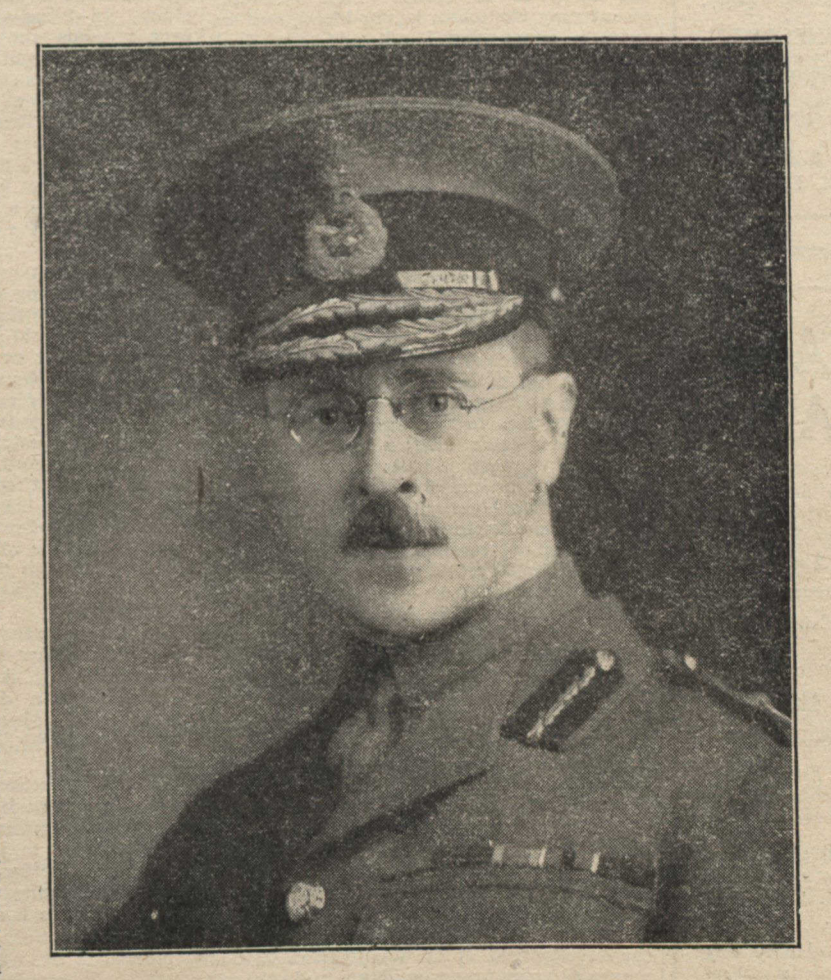
Beaver Gallery: No. 4.

arm of the service he had specialised in the Cana-dian Militia. He took part