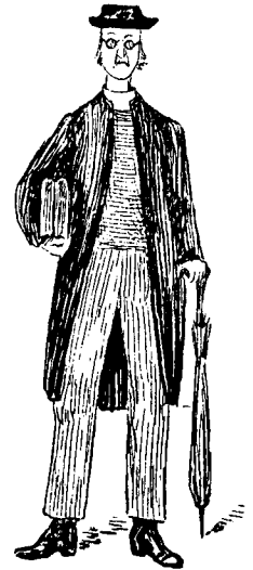
AS HE OUGHT TO BE