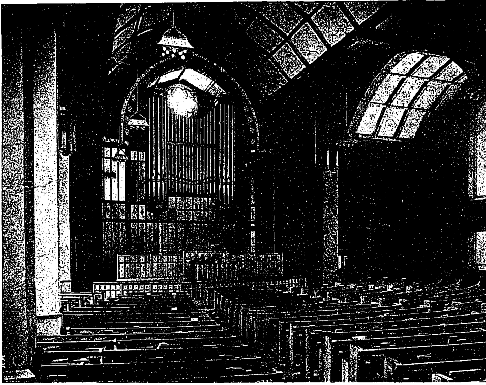
GENERAL VIEW OF AUDITORIUM, FIRST PRESBYTERIAN CHURCH, MONTREAL.

Of course, it is not to be understood that this is intended to minimize the value of notable examples which will always remain a source of inspiration and traditional guidance to church