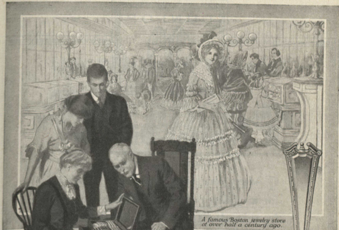
A famous Boston jewelry store of over half a century ago.

"That's the make of silver-plate that we received when we were married, and we still have some that was mother's"