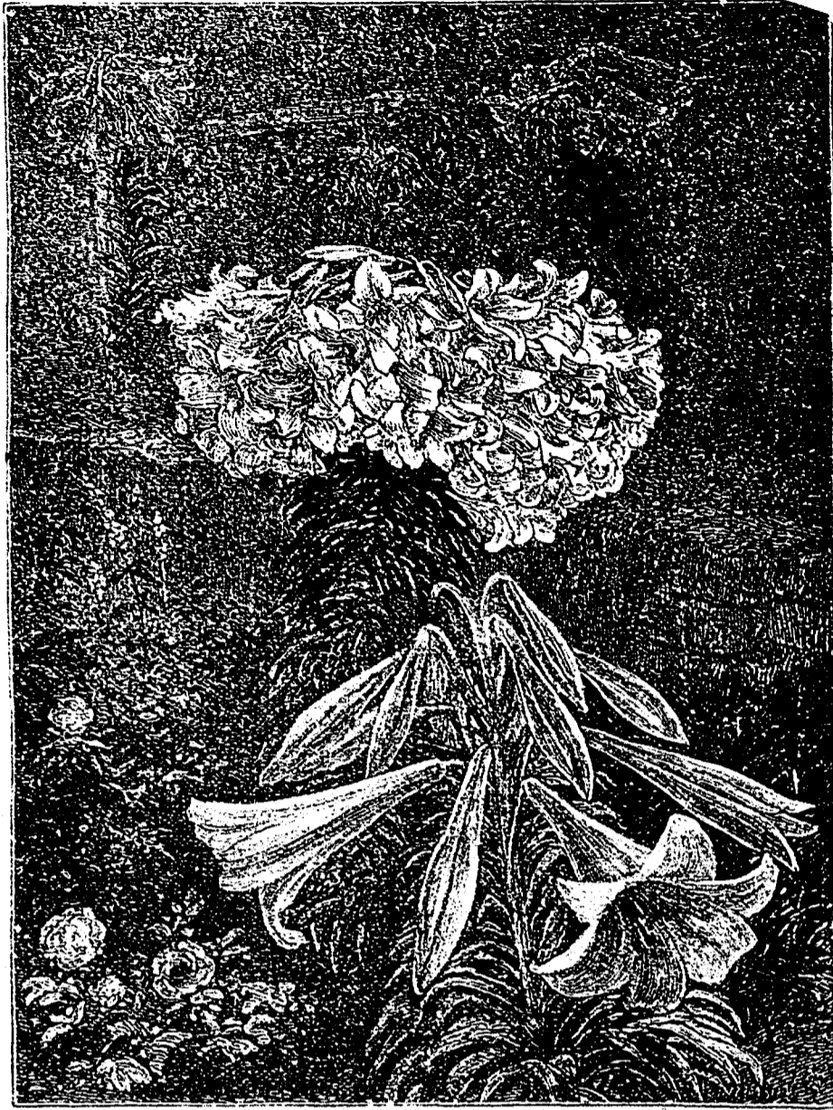
A BERMUDIAN EASTER LILY (145 BLOSSOMS ON ONE STEM.)