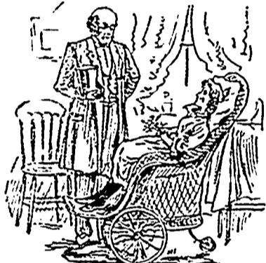
"Was merely a shadow of her former self"