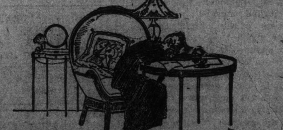
No. 8—Not being familiar with the road before her, she longs for the advice of her husband.

2ND ANNOU... RE... Already we are reserving from the West Indies those few who observe general us last season, think that the service... Present indic... West Indies th... those who are t... their passage r... The manum... to Demerara, r... $125.00. The... age is 40 days... THE REI... THE ROYAL M... 67-59 Grandville