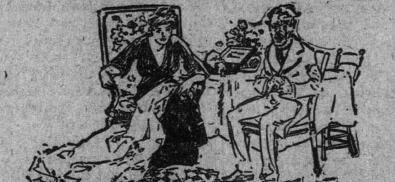
No. 3—Her father is greatly worried over his business, which needs capital.