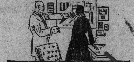
No. 2—She is strongly advised to buy land.