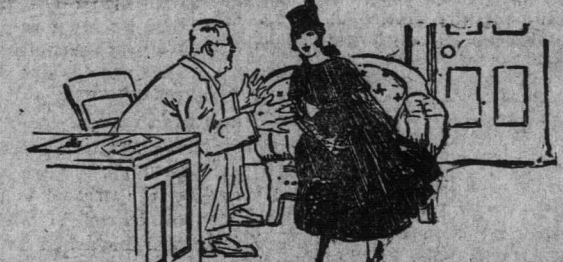
No. 4—Her husband's most intimate friend warns her against making a bad investment, but will not take the responsibility of advising her what to do.