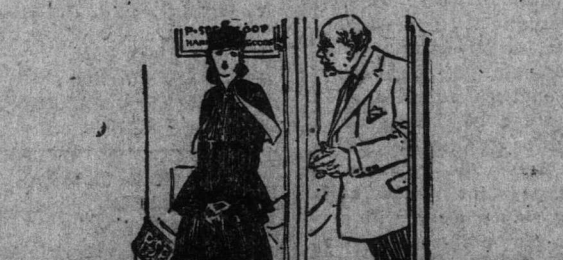
No. 6—Her uncle has worked out a plan for taking her into partnership in his business.