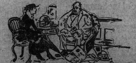
No. 7—An "old friend of her husband" offers an investment in oil shares paying 20% dividend.