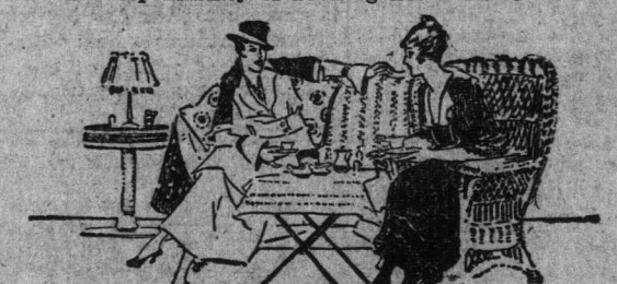
No. 5—Her sister thinks she should invest in flying machines and make a fortune.