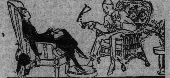
A WIDOW AND HER FRIENDS. No. 1—Her brother would like to borrow a few thousand dollars, to be paid back any time she needed it.