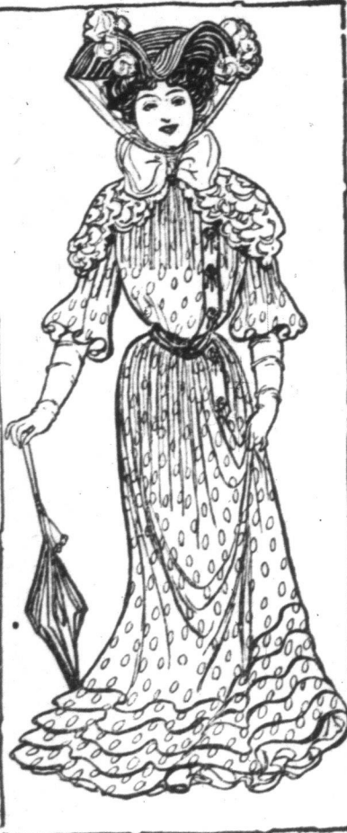
GARDEN PARTY GOWN.

A beautiful evening dress recently imported from Paris had a long point