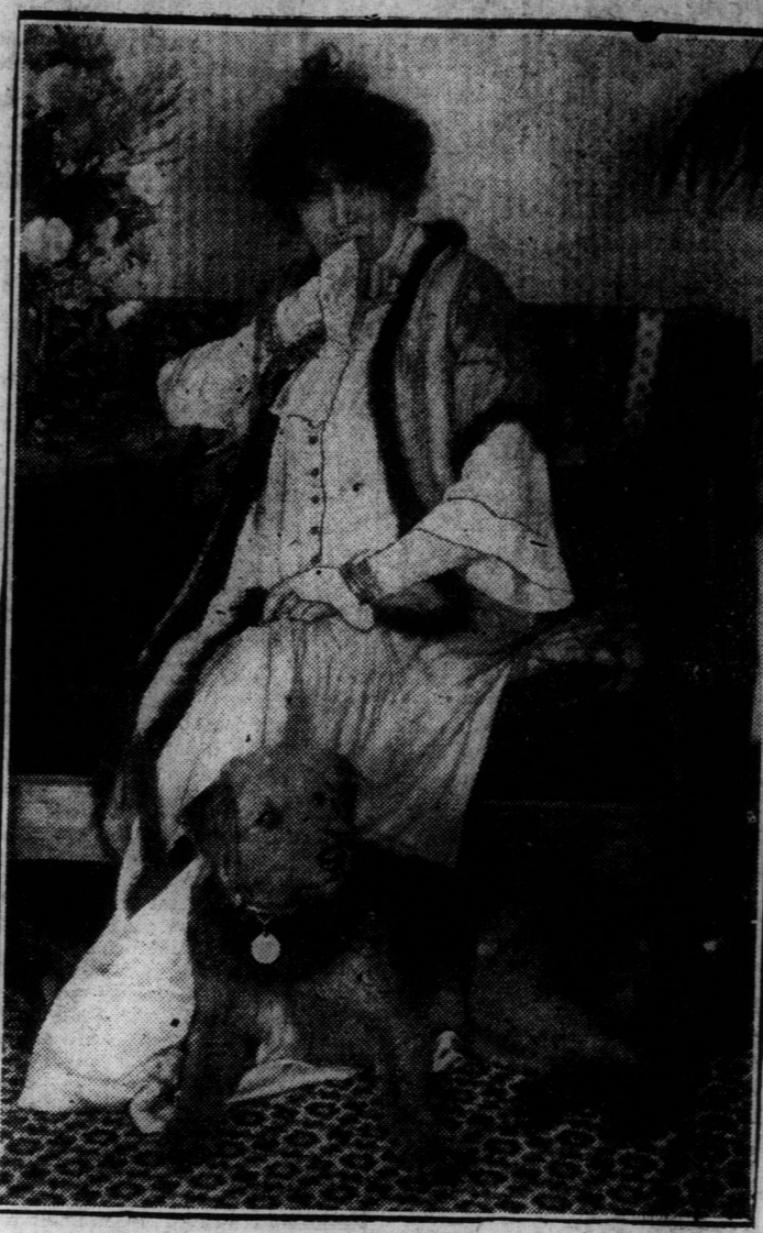
A duplicate of the gold medals presented to Marshall Joffre, President Poincaré of France, and Premier Viviani has just been given to Madam Sarah Bernhardt. The medal is in commemoration of the United States into the war. Madam Bernhardt is one of the few women present with the decoration of the Legion of Honor. She is 72 years of age and has recently been seriously ill.