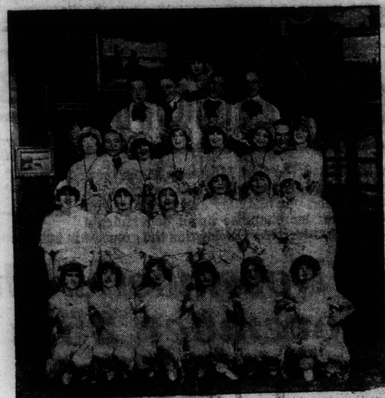
THE CLEVER DANCING CHORUS IN THE MUSICAL COMEDY DELIGHT "SEPTEMBER MORN," COMING TO THE GRAND

"The fact that the automobile means so much in the daily lives of