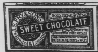
"GOLD MEDAL," SWEET.

ALL FRY'S GOODS PAY A GOOD MARGIN TO THE RETAILER.