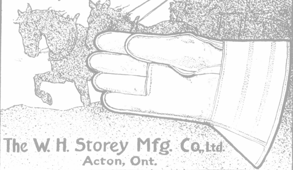
The W. H. Storey Mfg. Co., Ltd. Acton, Ont.

Tougher horsehide will never be found, because the best is used for Storey's Gloves and Gauntlets. And yet the skin, because carefully tanned by the chrome process, is made pliable, insuring extraordinary wear resistance. Waterproof and fire-proof—the best working gloves on the market. Sold at all stores. Insist on Storey's.