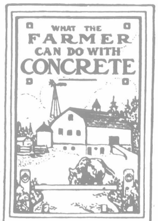
T HIS book of 160 pages, handsomely bound and illustrated with photographs, was the first, and is the best work describing the farmers' uses for concrete ever published. See free offer on this page.

CANADA CEMENT COMPANY, LTD. 550 Herald Building, Montreal