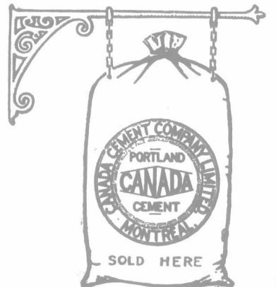
T HIS sign hangs in front of nearly all our dealers' stores. Let it guide you to the place where the best cement is sold.

I F you haven't received a copy of "What the Farmer Can Do With Concrete," write for it at once. It will be sent absolutely free, without obligating you in any way. Use a post card or clip out the coupon. We will also send particulars of the 1912 Cash Prize Contest. Address: