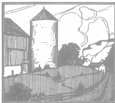
C ONCRETE is the ideal material for barns and silos. Being fire, wind and weather proof, it protects the contents perfectly.

Concrete may be mixed and placed at any season of the year (in extremely cold weather certain precautions must be observed) by your-