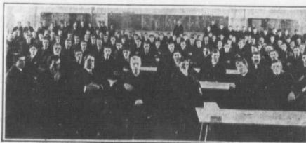
Students Judging Seed

Animal Husbandry Apiculture Arithmetic Bookkeeping Botany Chemistry (Inorganic) Dairying English (Composition Literature) Farm Mechanics Field Husbandry Geology Horticulture Physics (Mechanics Soil Physics) Poultry Veterinary Anatomy Veterinary Materia Medica Zoology