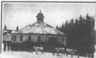
Students Judging Shorthorns

By the teaching of better methods of cultivation, a more systematic rotation of farm crops, the care and selection of seed, the identification of weeds, fungous and insect pests and by the improvement of the home surroundings, we hope to awaken an interest in the life of the farm such as will tend to keep at home farm boys who would otherwise migrate to towns and cities.