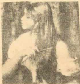
1044 RENOIR Jeune fille se peignant 44 x 36 cm Young girl combing her hair 17 1/4 x 14 7/8