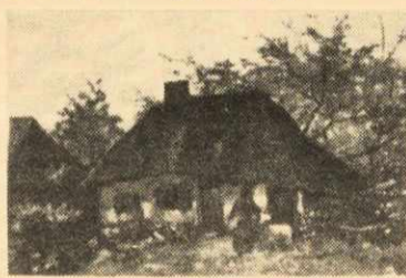
1039 VAN GOGH La chaumiere 36 x 55 cm Thatched cottage