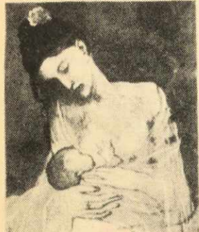
1002 PICASSO Maternite 48.7 x 37.4 cm Maternity 19 1/8 x 14 3/4