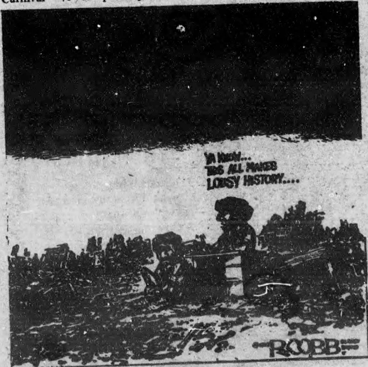
IN WINTER... THIS ALL MAKES LOUSY HISTORY....