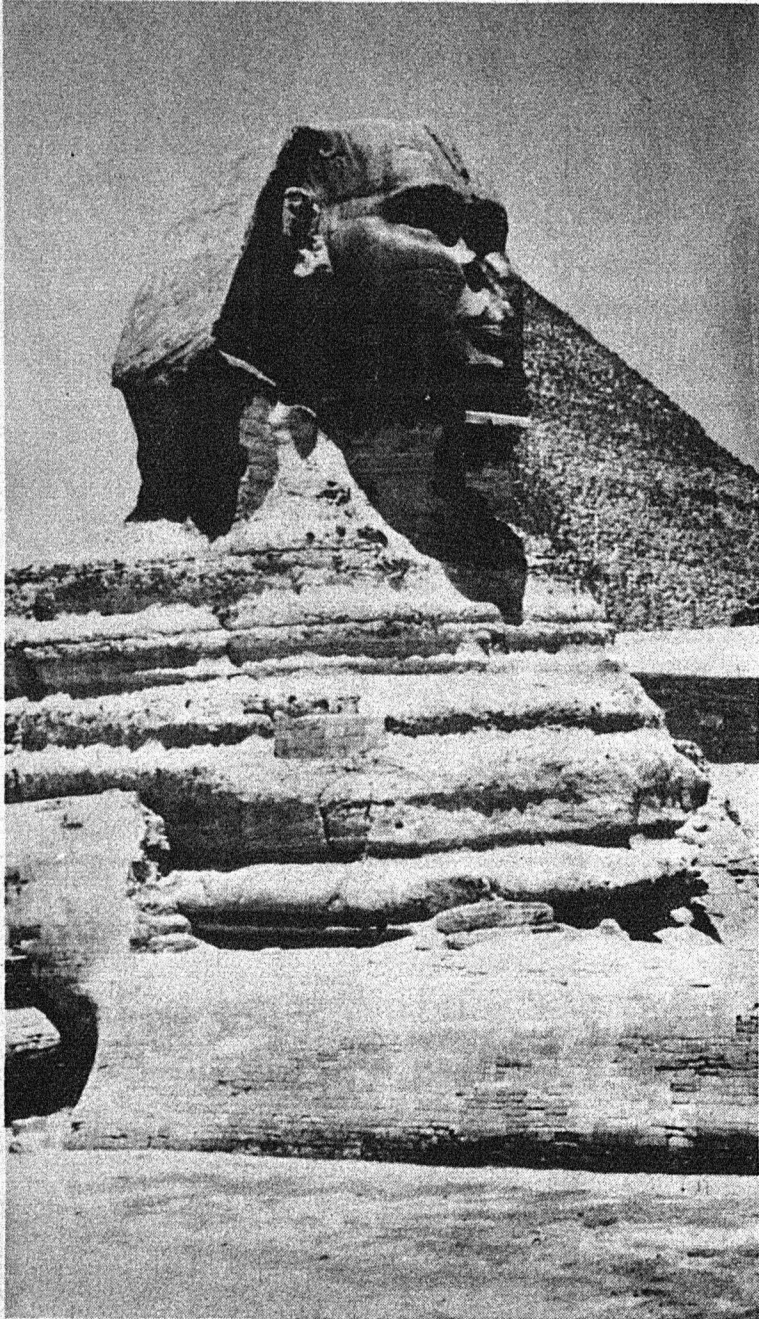
Near the southern mouth of the Suez Canal, an Israeli cannon bunker (bottom right) delivered part of a general bombardment upon the civilian town of Port Taufiq (below) just across the canal, before being destroyed itself in the Egyptian invasion.

Doug Elves was one of the two U of A participants in the 1975 research seminar in Egypt sponsored by the World University Service of Canada.