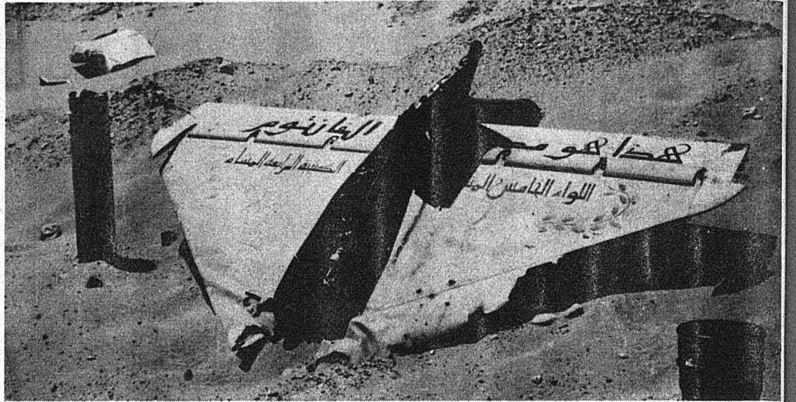
Israeli military hardware still lies strewn about in the Sinai desert.