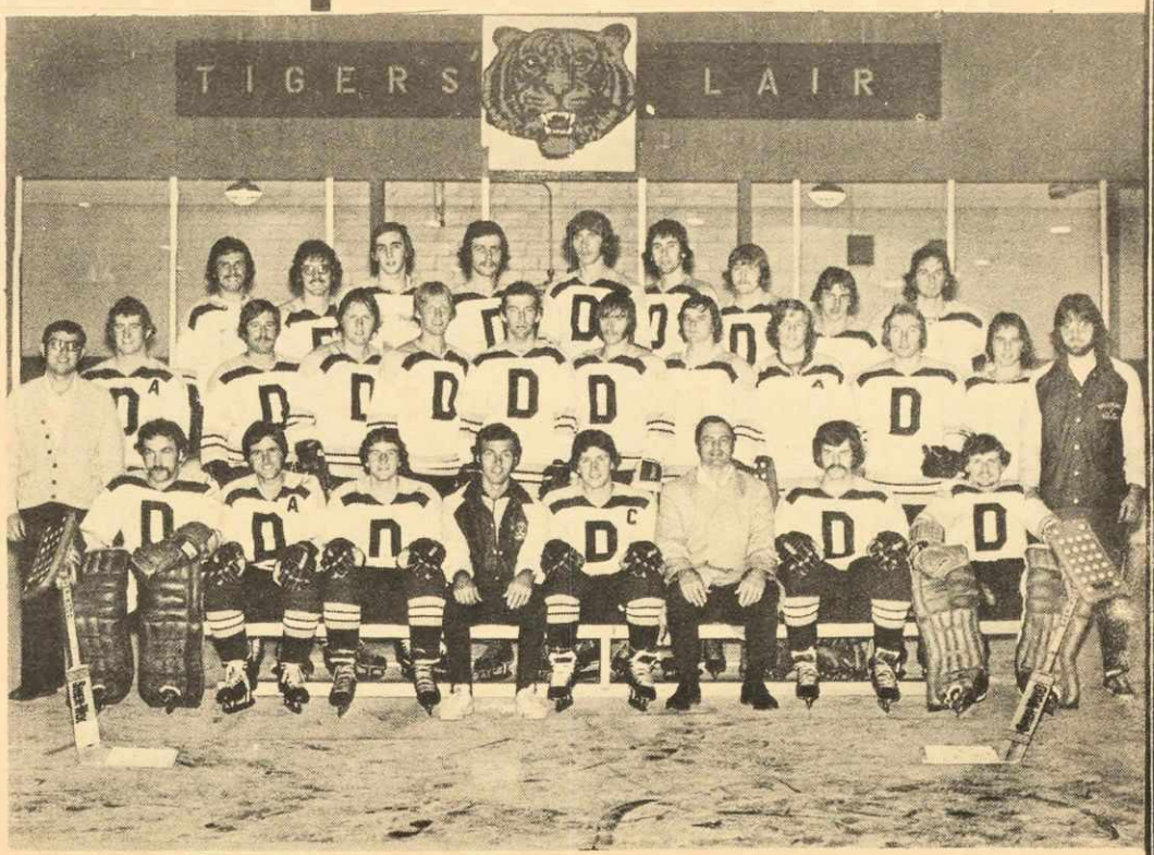
1974-75 Dal Hockey Team