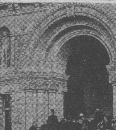
THE VISIT OF GENERAL KUROKI TO VICTORIA. The Formal Welcome on the Steps of the Parliament Buildings.