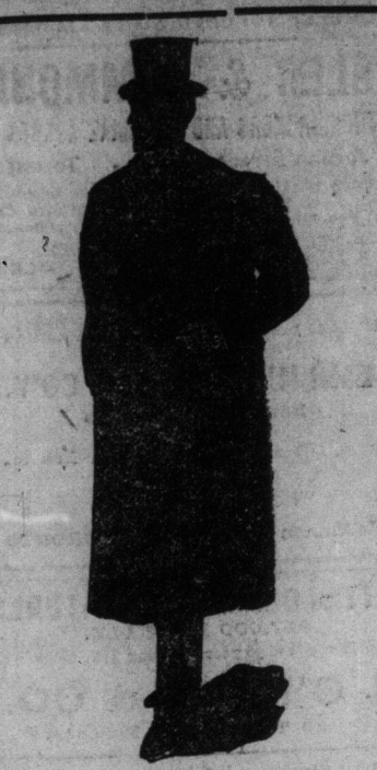
Our Lookout. "A Gentleman's Work" from

The last day of November—fall has deserted us—winter is here. We will now begin to give truth to Kipling's title for Canada—"Our Lady of the Snows."