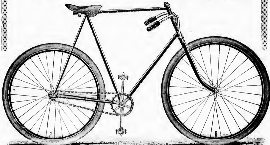
SMALLEY'S TRACK RACER—19 Pounds.

W. MANN & CO., 397 to 403 Clarence Street.