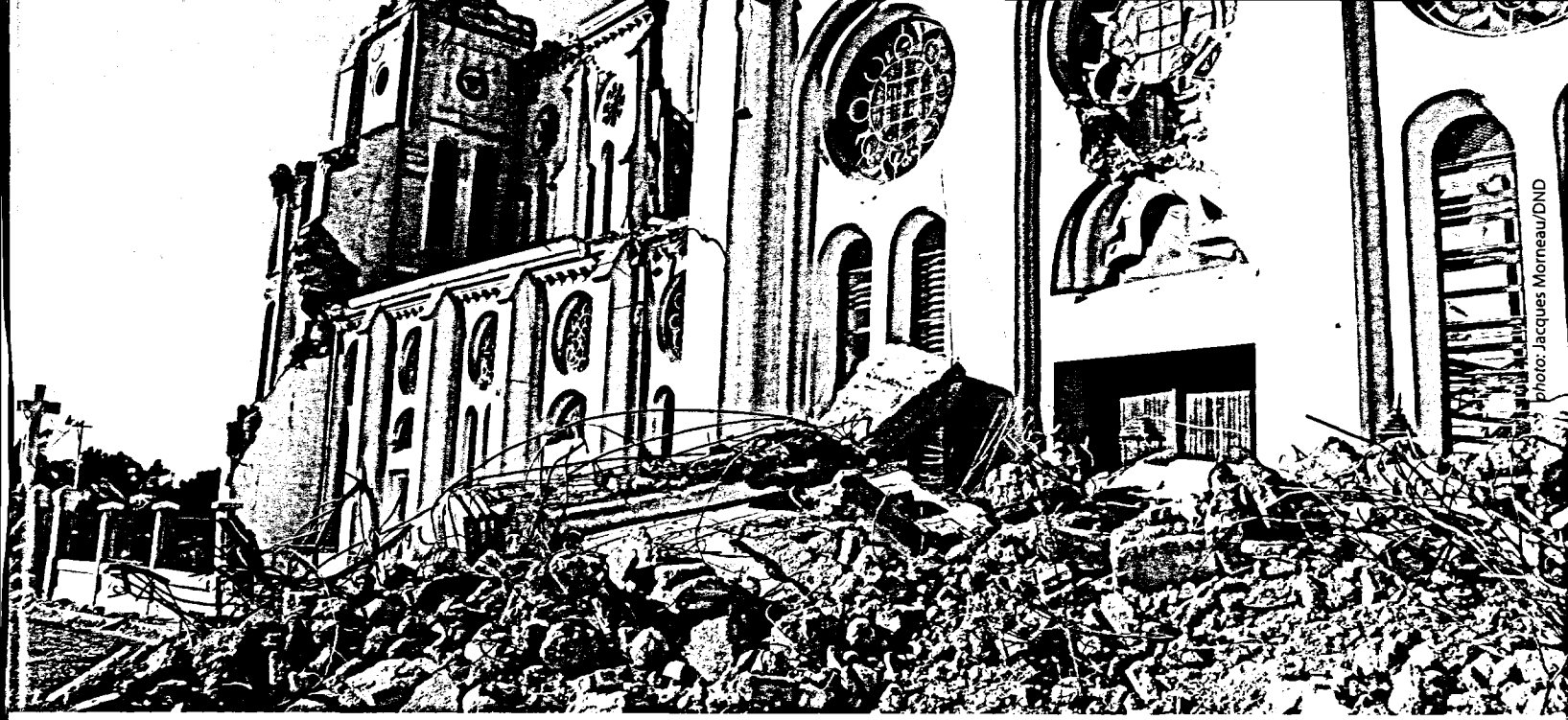
The Port-au-Prince cathedral was badly damaged in the earthquake.