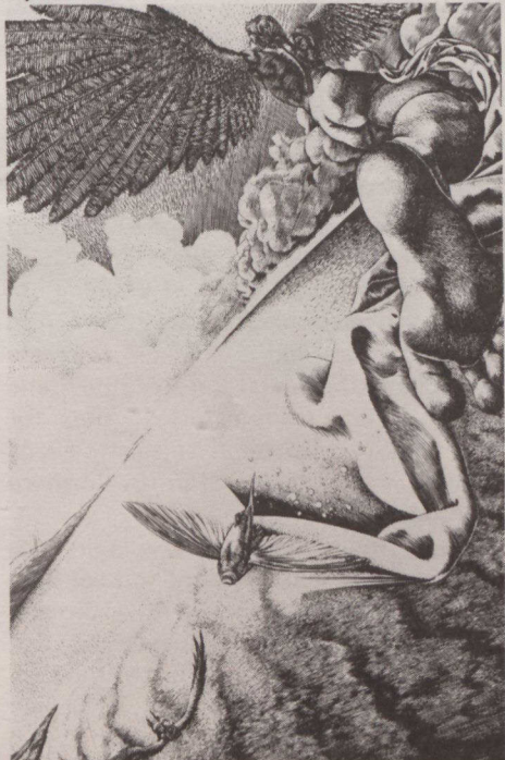
From Icare, ou le cycle des éléments, with engravings by Adriano Lambe.

The exhibition will be on display until April 18.