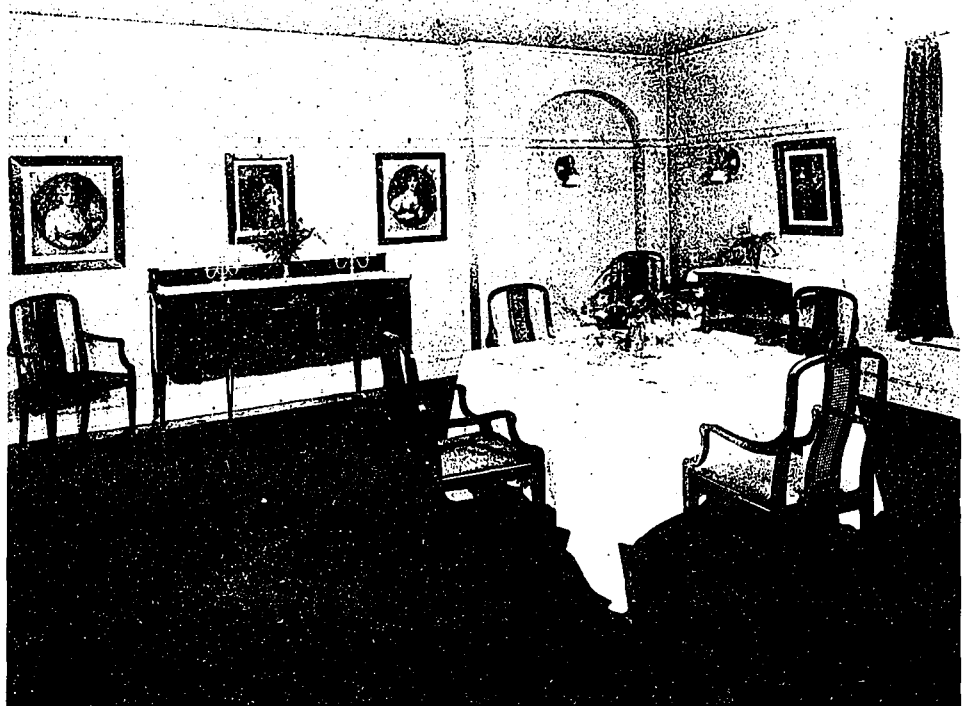
PRIVATE DINING ROOM, HOTEL VANCOUVER, VANCOUVER, B.C.

flowers bloom in profusion. One is up in the air indeed; looking over the parapet, the city spreads away out below like a huge map in perspective, with the people moving on the streets below reduced to pigmy proportions. From this elevated viewpoint the city shows to fine advantage, while the snow-crested and sun-lighted mountains to the north, and the sparkling waters of the Gulf of Georgia to the west offer natural vistas picturesque and bewitching in the extreme.