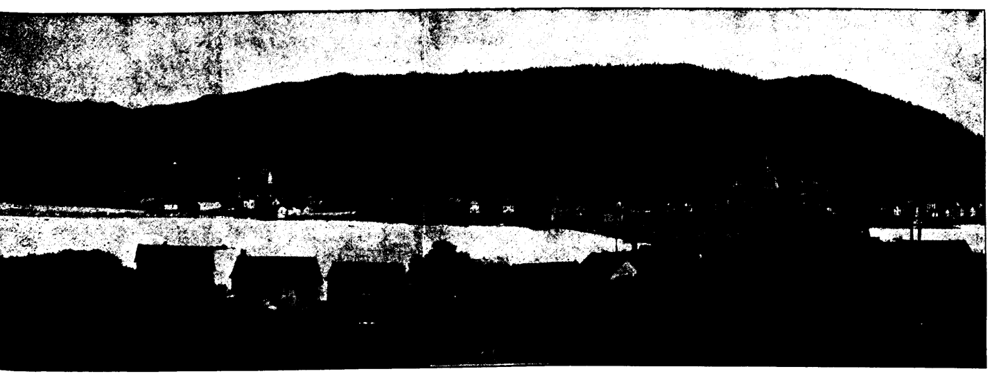
FORT SIMPSON, N.-W. COAST OF BRITISH COLUMBIA.