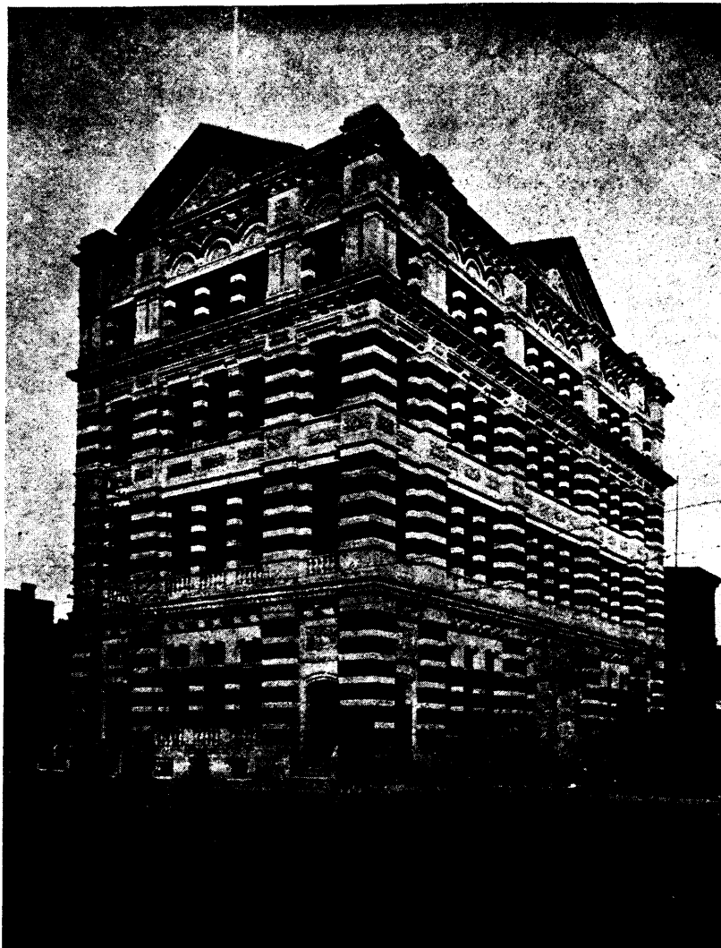
POST OFFICE, WINNIPEG.