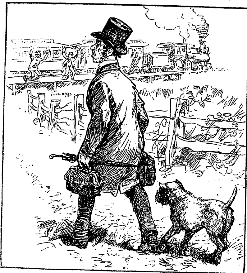
SMITH CATCHING THE TRAIN.

2. But the following day, when he was laid up with a cold, and somebody else took Miss Jones to the ball, he was not quite so happy.